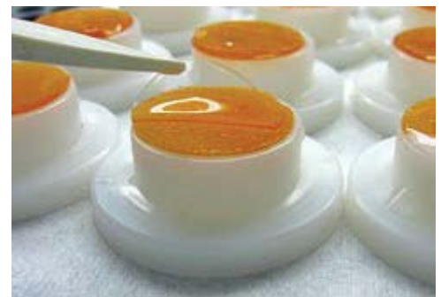
Figure 1: Components of the DGT method including the iron oxide binding gel (orange) underneath a clear diffusive gel. A filter paper is placed on top (not shown).

DGT has been developed for the assessment of available P in a wide range of soils. The mode of measurement is by diffusion of available P in the soil toward a P sink (an iron oxide gel) via a membrane which controls movement of P to the sink (Figure 1). The gel and protective filter paper are held securely in a plastic piston device. This is deployed on moist soil (Figure 2) for around 24 hours after which the device is washed, and the amount of P bound to the gel is then measured.