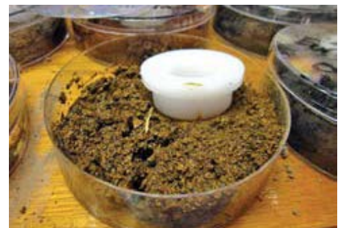
Figure 2: Measurement of available P by DGT. The DGT device is placed upside down on a moist soil (~100 % water holding capacity) for a period of time (typically 20–24 hours).

DGT critical values have successfully been determined from field trials across southern Australia for wheat, barley, canola and field pea crops.